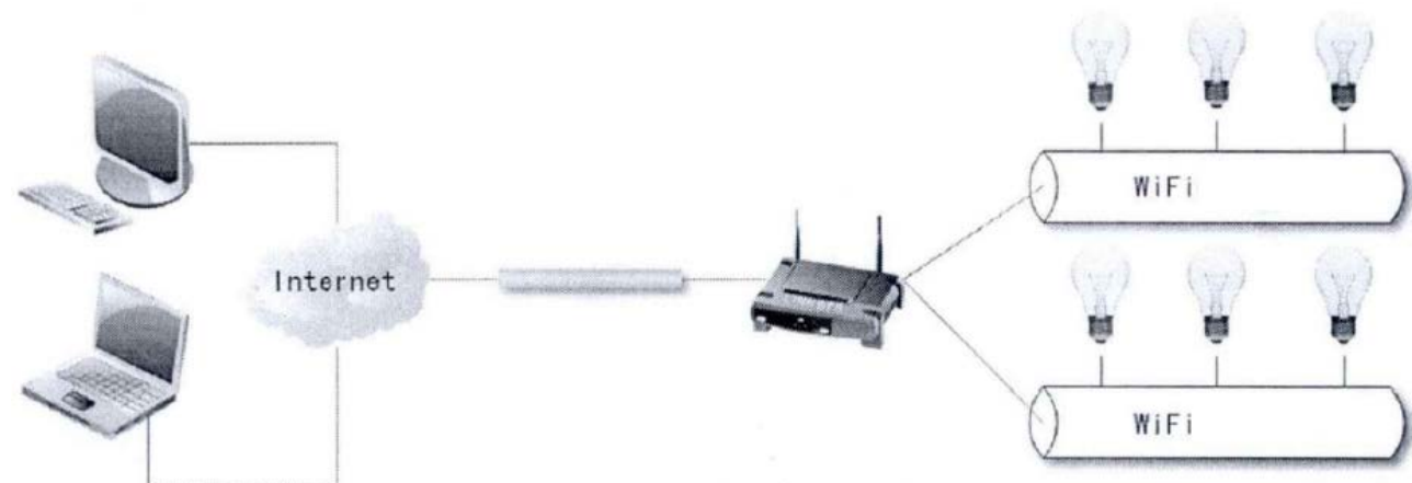
Fig. 2 Diagram of bench power supply control unit

We believe that the purpose of the internship is to be familiar with the server system environment. Only the use of virtualization is not in line with the internship requirements, so the amount of environment that the system can supply can be upgraded for this purpose. We have been in the Xen virtualization in Linux system; using Open VZ virtualization to improve the number of virtual environment system, to meet the needs of teaching, through the Open VZ, system virtualization, can provide a large number of experimental environment for practical use.