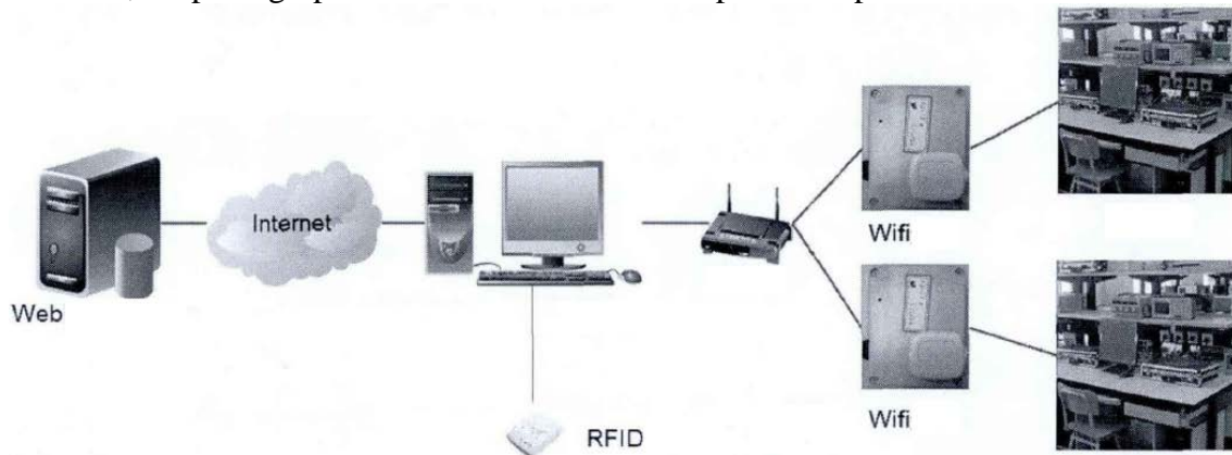
Fig. 3 Diagram of hardware system

First of all, a large cloud platform that is suitable for massive data computing and storage is built. And the user data, application software are deployed in the server cluster. Parallel and distributed computing technology is applied to provide users with high-performance services. The thin clients replace the host, which reduced the cost of laboratory construction greatly and improved the scalability of hardware devices. Video redirection technology is used to ensure the effect of client video playback. Using, the video files are sent to the thin client directly and decoded by the ARM hardware for playback, which reduced the occupation of the server CPU. In order to achieve the same user experience of cloud desktop with the PC. RDP8.0 efficient delivery protocol, detection of the network status, adaptive graphics and media flow are adopted to improve the transmission efficiency.